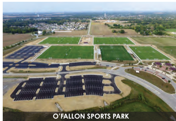
O'FALLON SPORTS PARK