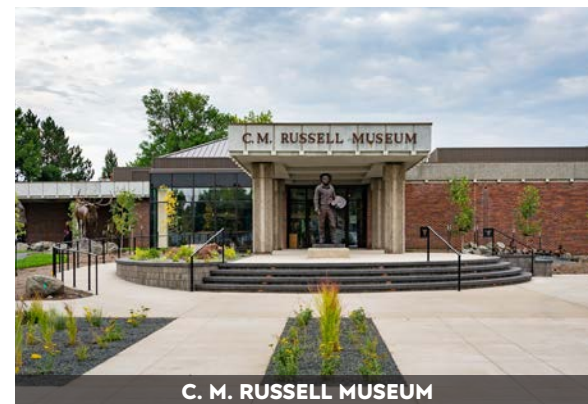
C. M. RUSSELL MUSEUM