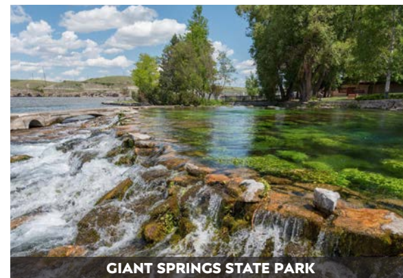
GIANT SPRINGS STATE PARK