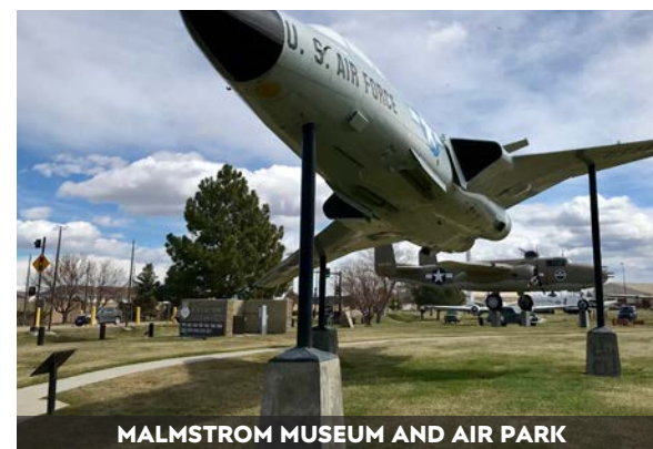
MALMSTROM MUSEUM AND AIR PARK