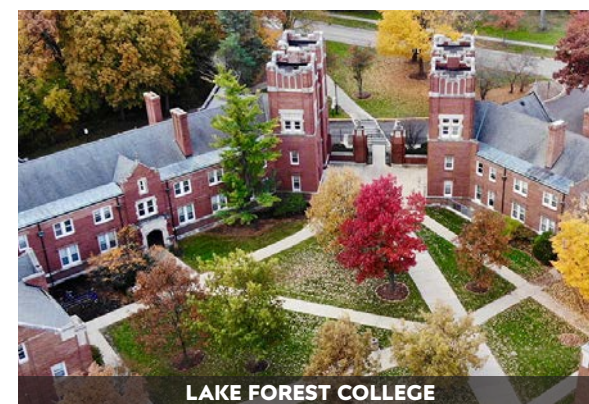
LAKE FOREST COLLEGE