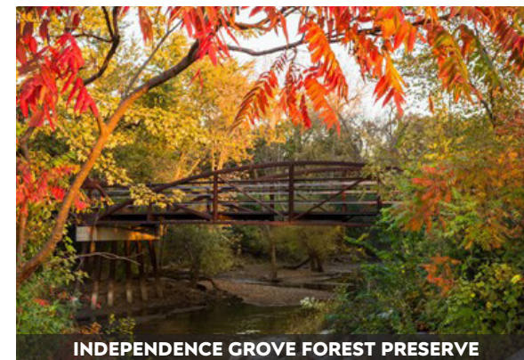
INDEPENDENCE GROVE FOREST PRESERVE