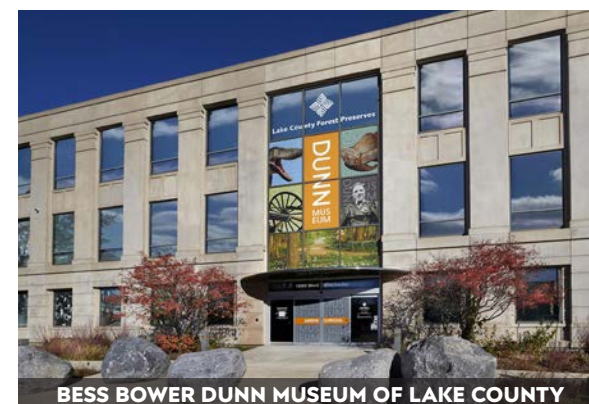
BESS BOWER DUNN MUSEUM OF LAKE COUNTY